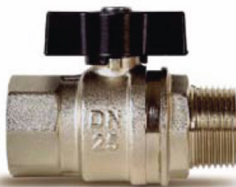
M x F - 00/0035