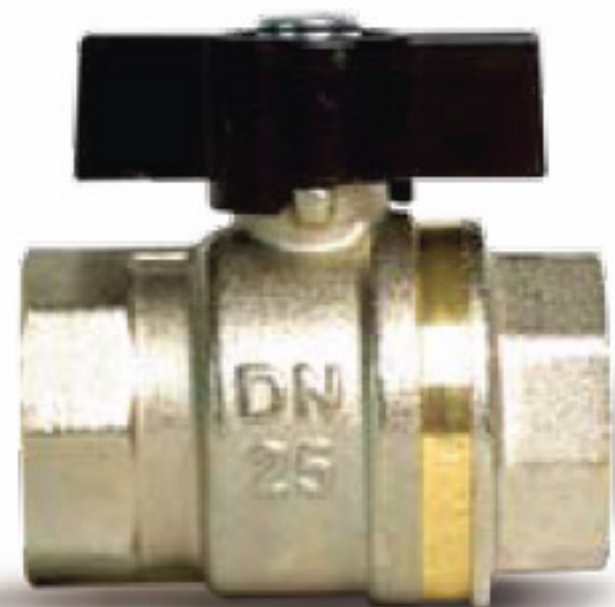
F x F - 00/0034